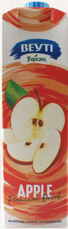
13243 BEVTI APPLE JUICE 12 X 1L