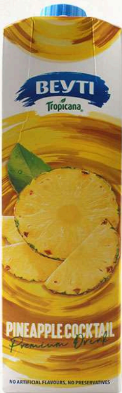
13244 BEVTI PINEAPPLE JUICE 12 X 1L