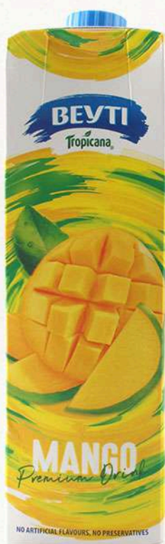
13247 BEVTI MANGO JUICE 12 X 1L