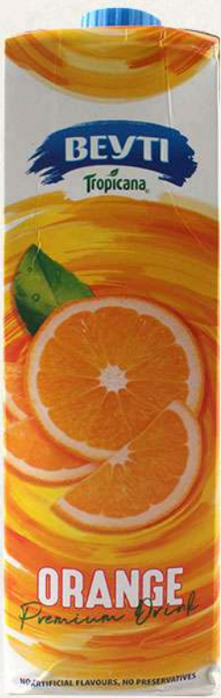
13242 BEVTI ORANGE JUICE 12 X 1L